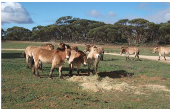
The Mongolian Wild Horses look lovely but they produce A LOT of waste!