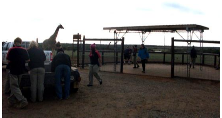
Students unload a trailer of rocks for a new public exhibit whilst Giraffe, Ostrich and Zebra look on