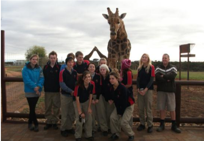
Group photo with some unexpected guests