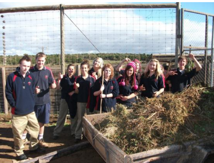
The class of hard workers filled the trailer in no time as they completely cleaned the Giraffe night area